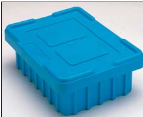
Tote Box with Snap-on Cover