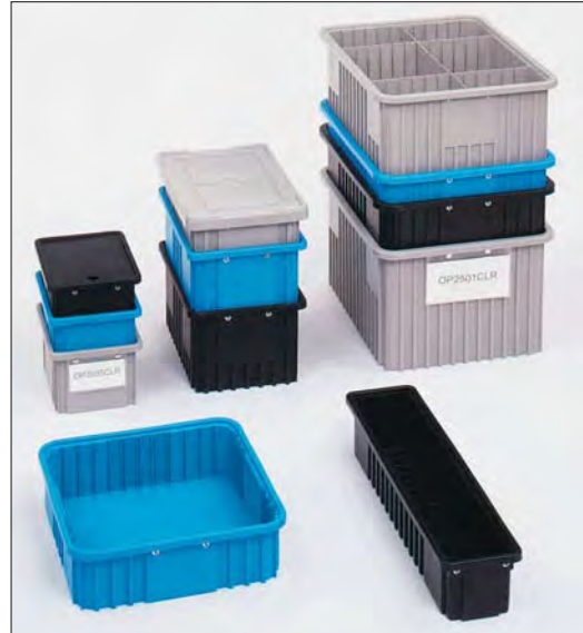
Metro Divider Boxes

BAS — Refers to Benstat™, Metro's patented static dissipative polypropylene-base material. Benstat has a surface resistivity of more than 10^5 ohms/sq. and less than 10^{12} ohms/sq. The standard color for any product with this suffix is blue.