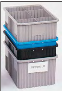
Tote Boxes (shown with Cardholder)